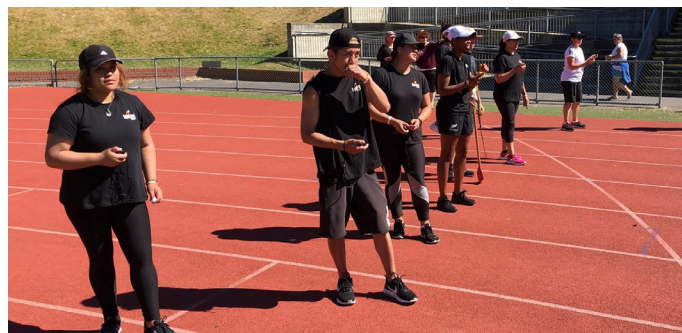
Above (both): The Ignite Sport team leads warm up at Athletics with a Disability day and officiates at the finish line.